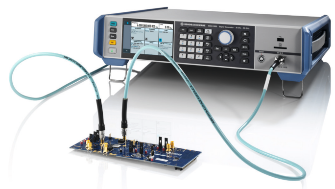
The R&S®SMA100B provides extremely clean clock signals.

Today's digital designs and high-speed data converters require clean clocks with minimal jitter.