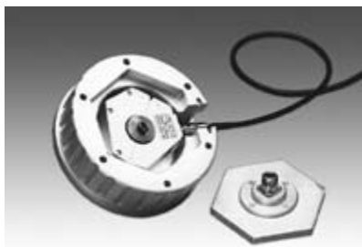
Calibration Jig R&S® EZ-18 with Current Probe R&S® EZ-17 inserted and cover removed